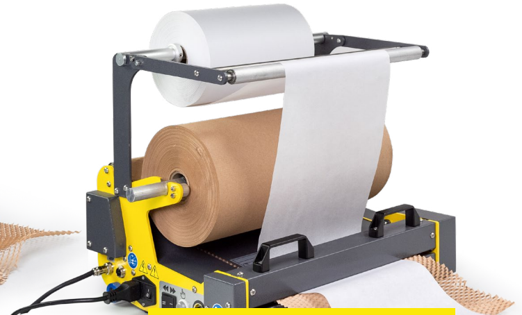
X-Wrap DD 380mm Dispenser with Interleaf paper