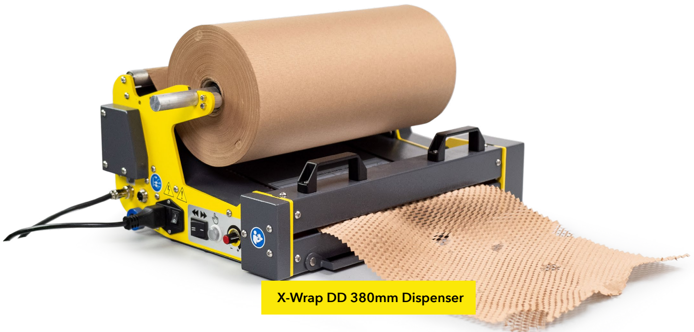
X-Wrap DD 380mm Dispenser