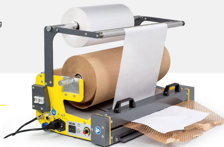
X-Wrap DD 490mm Dispenser with Interleaf paper

2 Width Options: 380 mm & 490 mm to adapt to the products